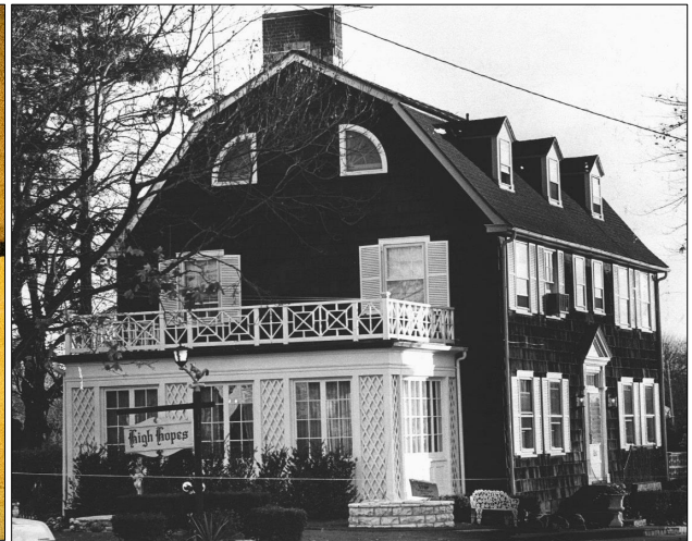
Left: The "Ghost Adventures" team gear up for an eerie investigation inside Los Angeles' Cecil Hotel Right: The infamous Amityville Horror House in Long Island, New York, is the focus of a new "Shock Docs" special

NEW YORK (December 18, 2020) – All your favorite shows are coming to Discovery, Inc.'s new discovery+ streaming service beginning Monday, January 4. The Paranormal & Unexplained genre hub on discovery+ will launch with nearly 3,000 episodes of paranormal programming in its extensive library, establishing the largest collection of paranormal content available to users anywhere in the world. At launch, the platform will have more than 100 series under its "Paranormal & Unexplained" banner, and nearly all will be available to binge from the beginning.